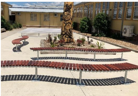
EM038 timber batten option