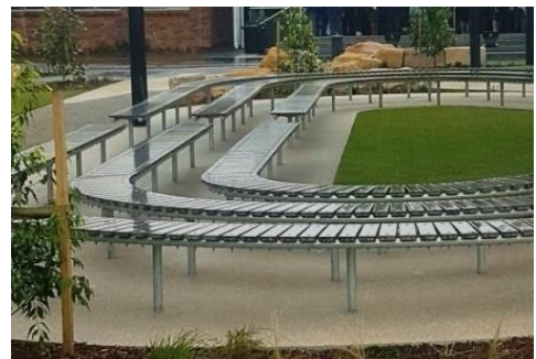
EM038 composite batten option